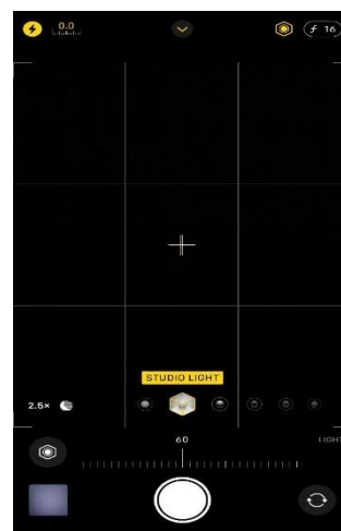
Figure 2: Portrait mode with studio light setting with exposure of f-60