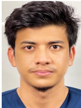
Figure 3: Image produced in Portrait mode with appropriate studio light setup