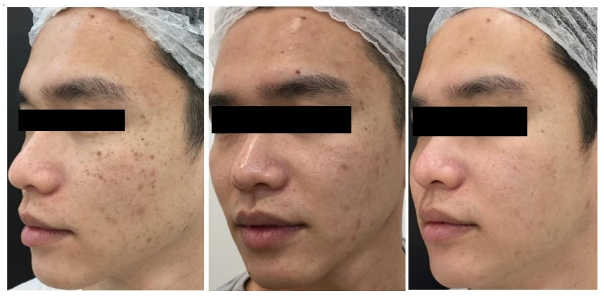
Figure 4: Left face (45 degree) view photos of first (left), fourth (center) and eighth (right) treatment. Noted that there is significant improvement of the freckles on left side of face.

Although QS 532- and 1,064-nm Nd:YAG lasers are still the most widely used devices for treating various pigmentation disorders, QS ruby lasers with a wavelength of 694 nm have been shown to facilitate better absorption by melanin than QS 1,064-nm Nd:YAG lasers and weaker absorption by hemoglobin than 532-nm lasers. Reportedly, QS ruby lasers have proven successful in tattoo removal and in treating cutaneous pigmentations lesions, including melasma,