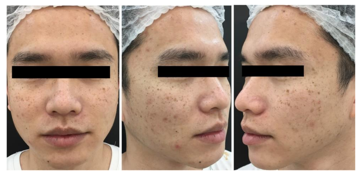
Figure 1 : Front, right face (45 degree) and left face (45 degree) view photos of patient during the first presentation. Noted that there are multiple freckles over bilateral cheeks, nose and forehead.