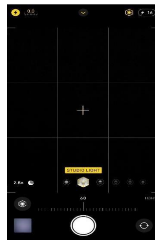
Figure 2: Portrait mode with studio light setting with exposure of f-60