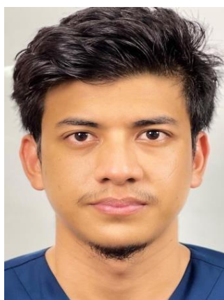
Figure 3: Image produced in Portrait mode with appropriate studio light setup