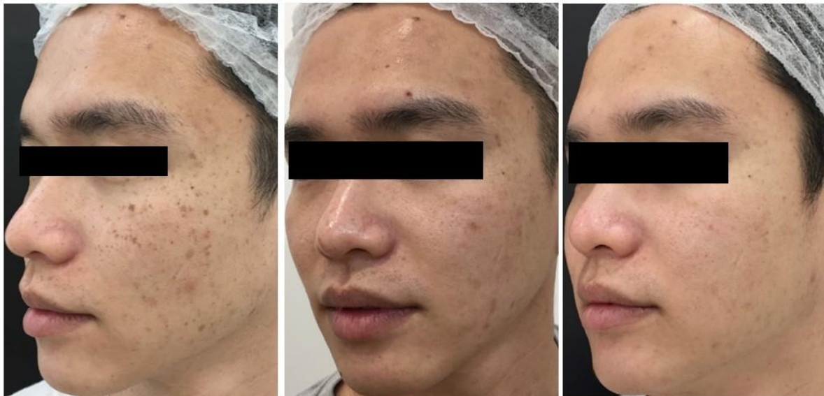
Figure 4: Left face (45 degree) view photos of first (left), fourth (center) and eighth (right) treatment. Noted that there is significant improvement of the freckles on left side of face.

Although QS 532- and 1,064-nm Nd:YAG lasers are still the most widely used devices for treating various pigmentation disorders, QS ruby lasers with a wavelength of 694 nm have been shown to facilitate better absorption by melanin than QS 1,064-nm Nd:YAG lasers and weaker absorption by hemoglobin than 532-nm lasers. Reportedly, QS ruby lasers have proven successful in tattoo removal and in treating cutaneous pigmentations lesions, including melasma,